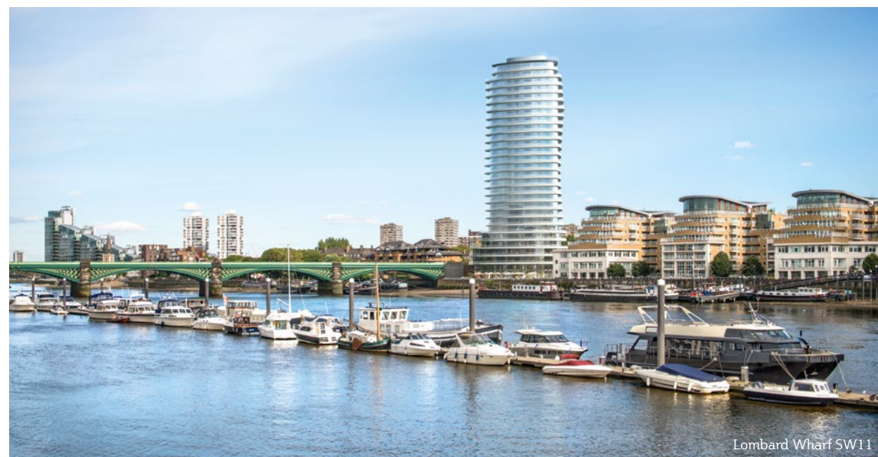
Lombard Wharf SW11

If you have any problems meeting the agreed deadlines or if you change your mind during the reservation period, please let us know straightaway. If the exchange of contracts doesn't take place within the agreed period, then the Reservation Agreement ends immediately and your home may be put back on the market.