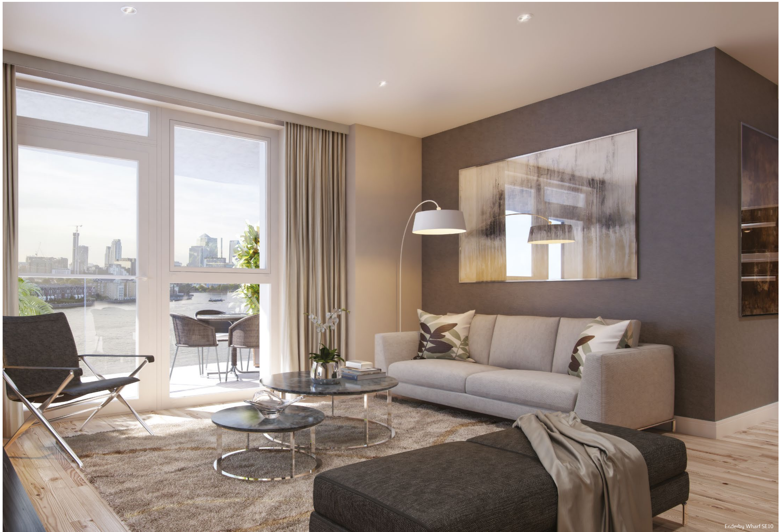
Enderby Wharf SE10